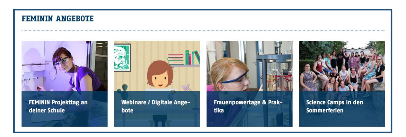
Figure 4: Project's FEMININ offers in the subjects of mathematics, computer science, natural sciences and technology to participate, experience and try out