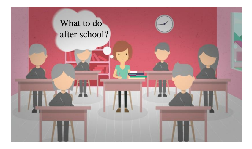
Figure 3: Screenshot from the video "From Talent to Dream Job" – ZUKUNFT FEMININ

At each science camp, a film documentary was produced together with the participants, which is well suited to convince other girls but also parents and peers of the abilities of the participants. In addition, small videos with job profiles were created.