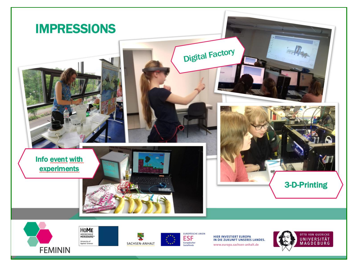
Figure 2: Impressions "ZUKUNFT FEMININ"